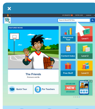
Search by Keyword

Once you're logged in, you'll have full access to the resources included in your subscription. To find what you need, use the Content Index - accessible from the homepage - or one of these options: