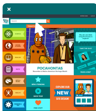
Search by Keyword

Once you're logged in, you'll have full access to the resources included in your subscription. You can find relevant content a number of ways: