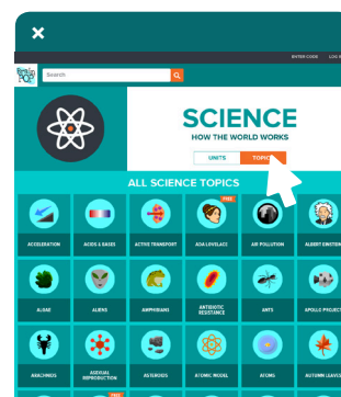
See All Topics